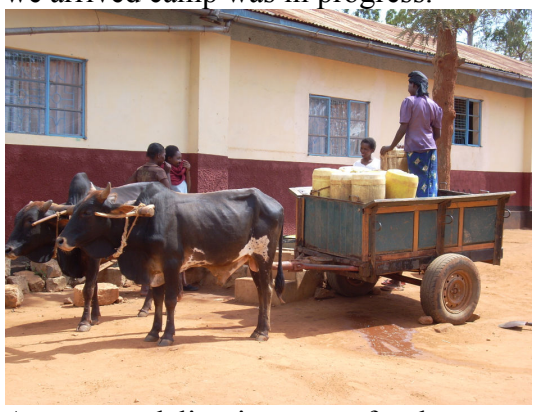
An ox cart delivering water for the camp

widows. The drought had been severe in the Machakos and surrounding areas. Later that day we traveled to A.I.C. Kakuswi where we would live in a small house on the church property for the remainder our ministry in Kenya. When we arrived camp was in progress.