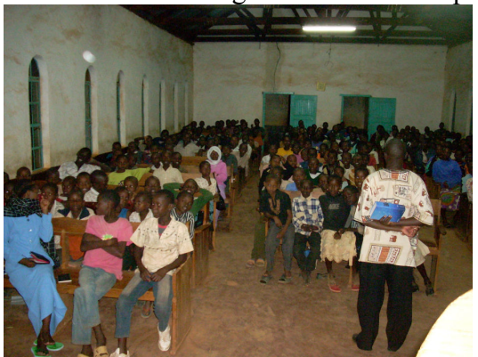
We shared testimony last night of camp

Most of our meals were taken in the homes of church families. For breakfast, they brought us eggs, bread and fruit. We had a small one burner propane tank and no refrigerator. We had electricity, when it was on. Often, it went off in the whole area. There was a big propane lantern. The choo (outdoor toilet for church use as well) was about 100 feet from the house. We thought we were on the property alone at night, but later we learned that there was a very good night watchman.